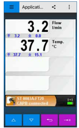
Example for measurement on EuroSoft live app