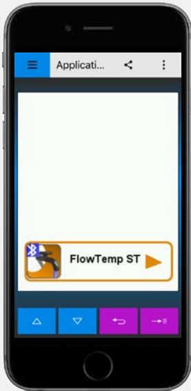
Example on your Smartphone