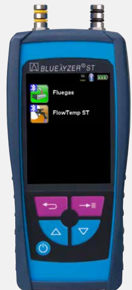
Example on our BLUELYZER ST